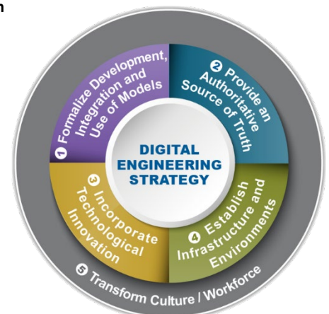
Figure 2. Digital Engineering Goals

DE and M&S align and coordinate best practices for digital twins, enabling the digital thread by establishing a comprehensive framework for system development and management. DE provides the foundation, creating accurate digital models of assets or systems, setting standards for data exchange and interoperability. M&S complements DE, offering virtual environments for iterative testing, analysis, and validation. Together, DE and M&S improve collaboration and information exchanged throughout the life cycle. This alignment facilitates efficient design, optimized performance, reduced costs, and informed decision making, fostering innovation in complex system development.