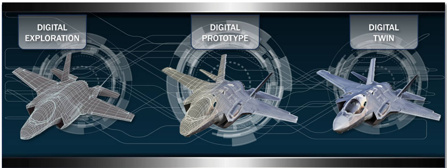
Figure 1. Enabling the Digital Thread and the Digital Twin

The DEM&S directorate supports the Office of the Assistant Secretary of War for Mission Capabilities, Systems Engineering and Architecture (SE&A) by providing DE and M&S strategy, policy, guidance, and leadership for the DoW and the industrial base, elevating DE & M&S practitioners and promoting an updated workforce and culture.